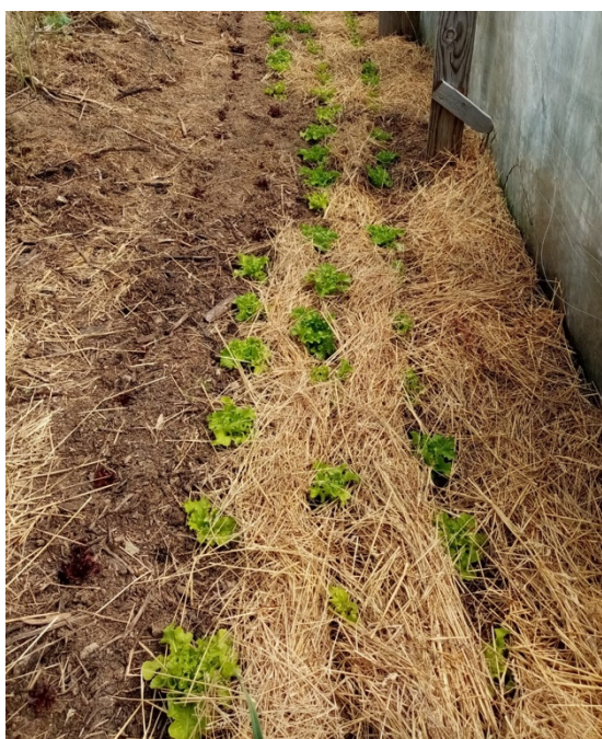
Salad plantation in an organic mulch

Even if the raw materials used in his organic mulches are not necessarily organic, they remain more respectful of the environment than conventional plastic mulching (local resources). Ultimately, Guy Rugemer would like to self-produce his mulch by mowing the grass strips on his lands.