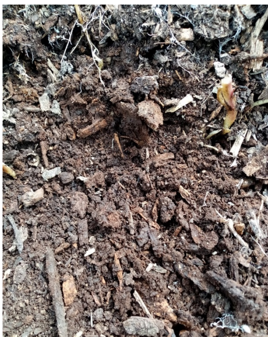
Green waste in decomposed

"It is possible with all plants, even conifers! It's all a question of time: the right fungi must develop to decompose the mixture." Guy Rugemer