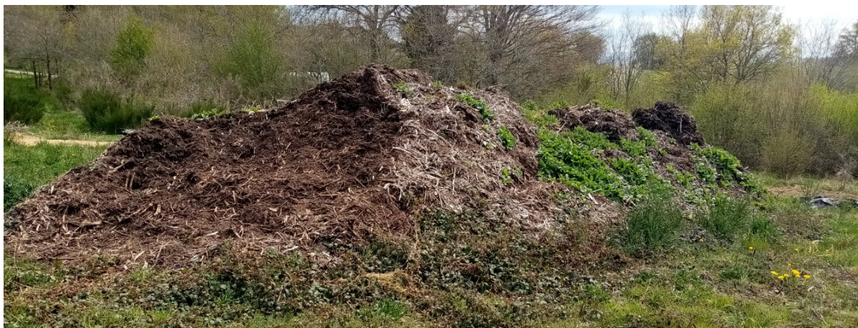
Pile of green waste in decomposition

Guy Rugemer lets the pile decompose without intervening because he is not equipped enough to turn it over and ventilate it, and because this step would be too time-consuming. The decomposition is however quite slow (between 2 and 4 years), which requires forward planning.