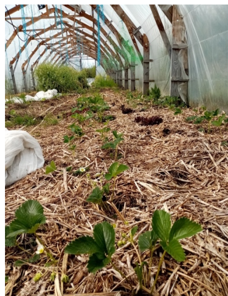
Strawberry plants in an organic mulch

The thickness of the top layer must be constant: straw, hay or preserved fodder should be added as soon as necessary. The three centimeters of woody mulch is however sufficient to feed the land for three years.